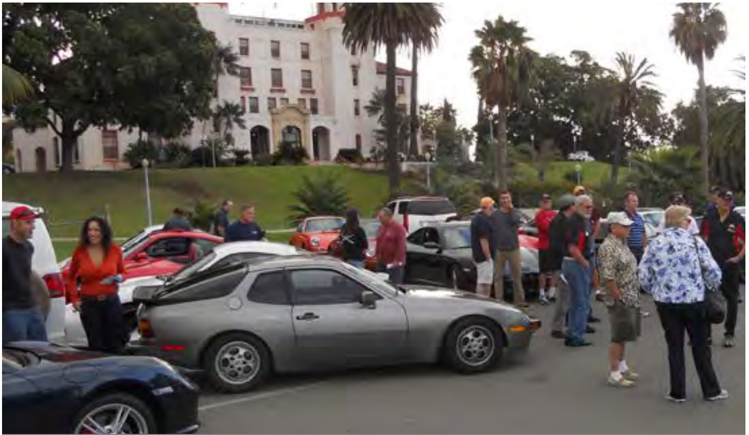
The tour rendezvous at the Veteran's Museum parking lot.

all this to the guard, he looked at me like my space ship was double parked. A quick inventory of the guard shack produced the list. All good!