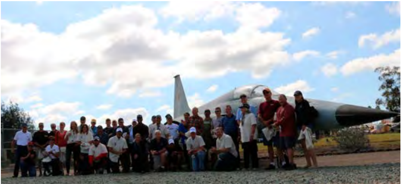
The full gang – Warriors and PCA/SDR Drivers with a very cool F-5 Tiger II as backdrop.

An exciting day indeed, but the parking snafu was the second snag of the morning and the tour hadn't even begun. The first took place minutes earlier when I visited the guard at the Naval Regional Medical Facility (Balboa Naval Hospital) front gate. I just wanted to make sure the driver's list had been passed and briefed to the security personnel. When I explained