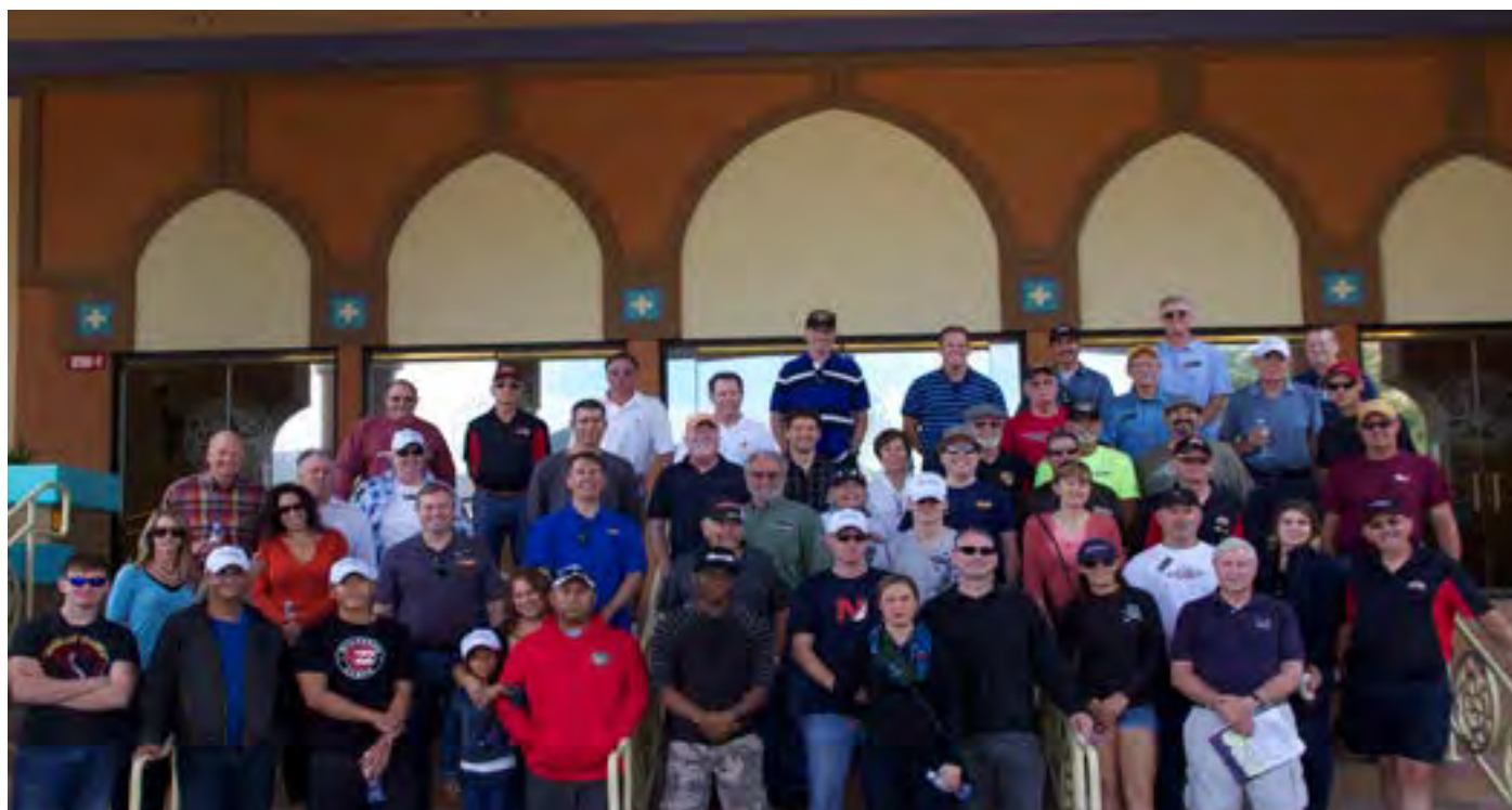
2014 Warrior tour