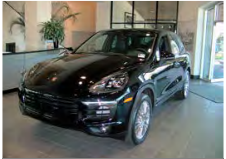
A Jet Black Metallic 2015 Cayenne S looking good