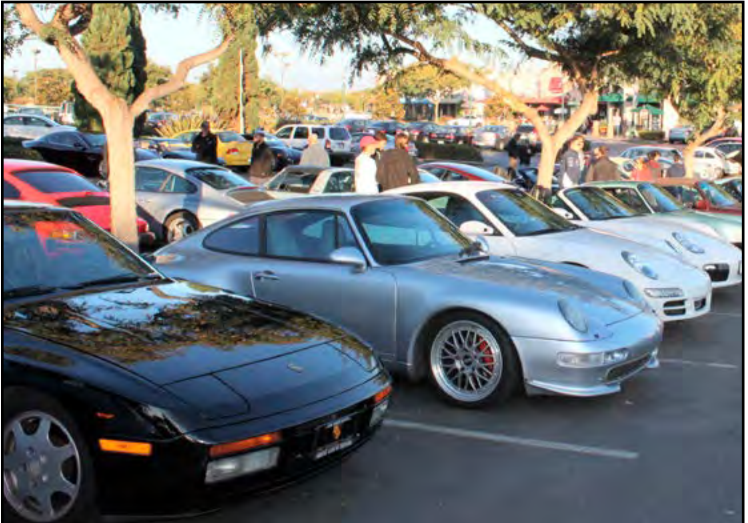
A magnificent array of our club members' Porsches