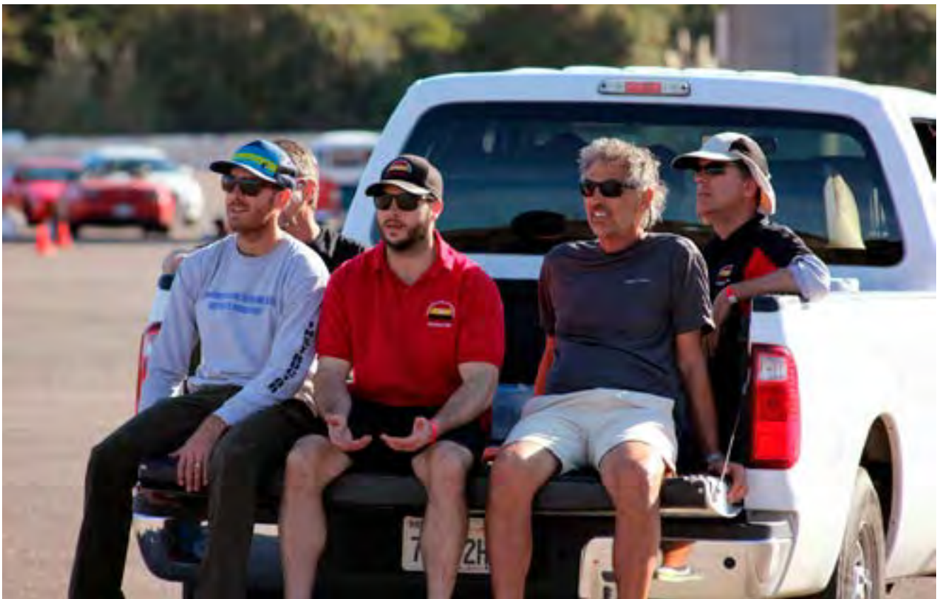
Corner workers at SDR Autocross November 22nd

High Performance Motorsports Buy Porsches w inspection reports, carfax receipts under blue book. Porsches Approx 10% to 50% under KBB www.hpmsd.com (858) 735-1013