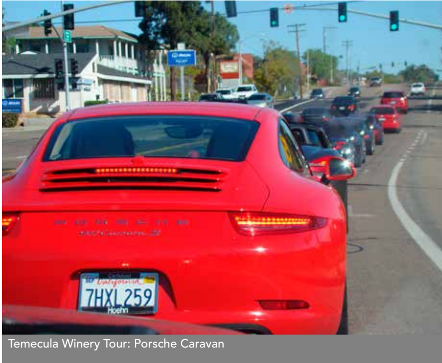
Temecula Winery Tour: Porsche Caravan

Winery, Robert Renzoni Vineyards & Winery and Monte De Oro Winery & Vineyards.