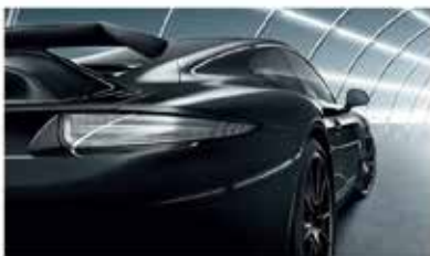
Aerokit Cup with clear tail lights