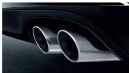
Sport tailpipes and exhaust systems