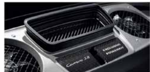
Powerkit for the 911