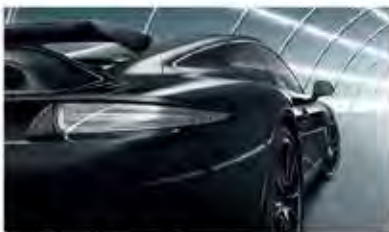
Aerokit Cup with clear tail lights