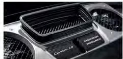
Powerkit for the 911