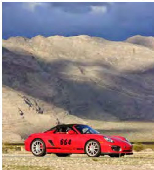
From the Spring Mtn. TT