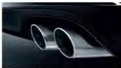
Sport tailpipes and exhaust systems